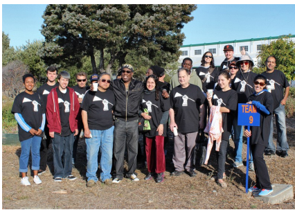
Clean Team - Warm Water Cove Park 9/28