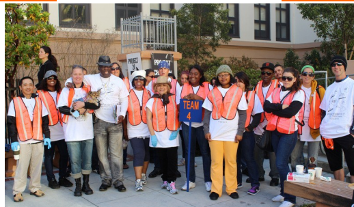
Clean Team event—Galileo Academy