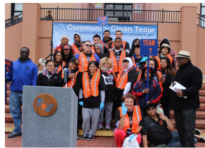
Clean Team event—Balboa High